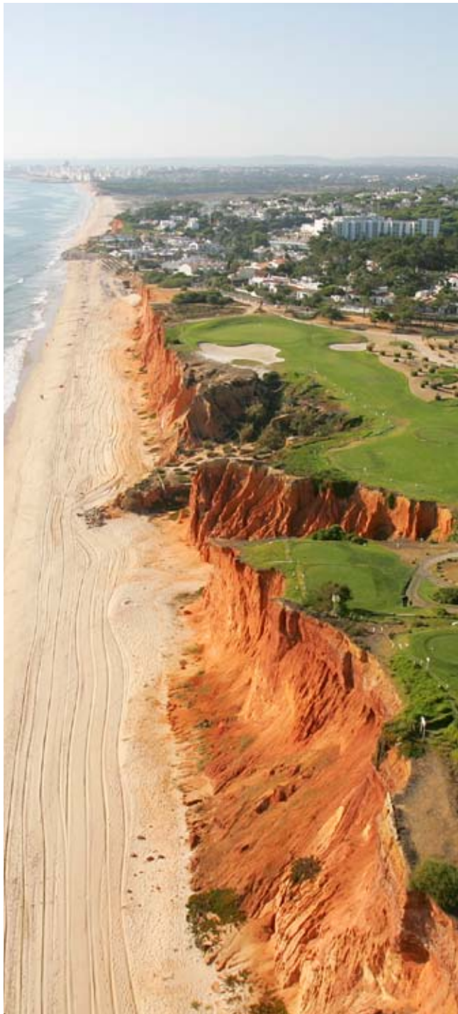
Royal Ocean Course