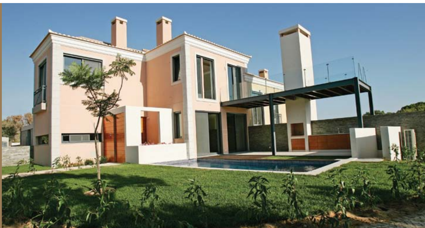
Royal Golf Development

Some of the last true beachfront land available in Portugal can be found here. Oceano Clube directly overlooks the Atlantic waves and is flanked by a nature reserve. While it is home to the award-winning Oceano Apartments, it is primarily given over to plots for customised villas, of which construction began four years ago.